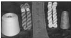
Roving Winds Farm