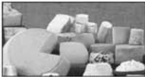
Association laitière de la Chèvre du Québec